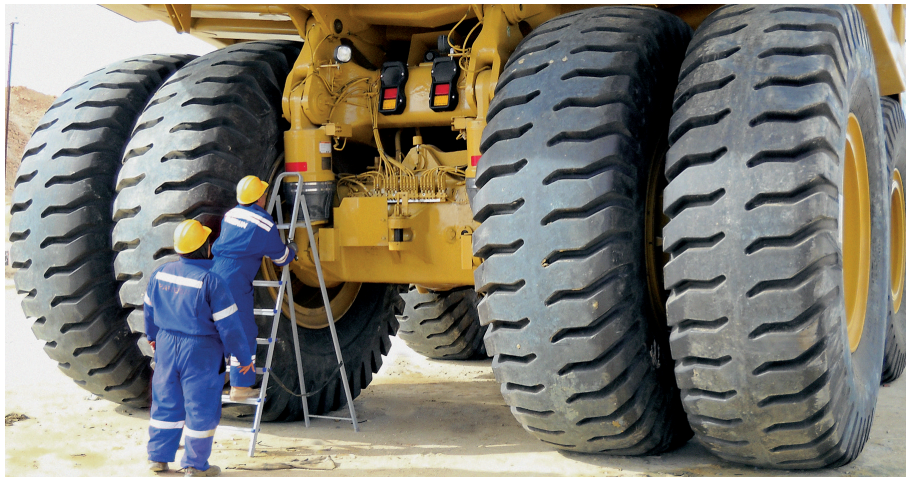
Eurotire has taken substantial actions to support the growing global demand for its products.